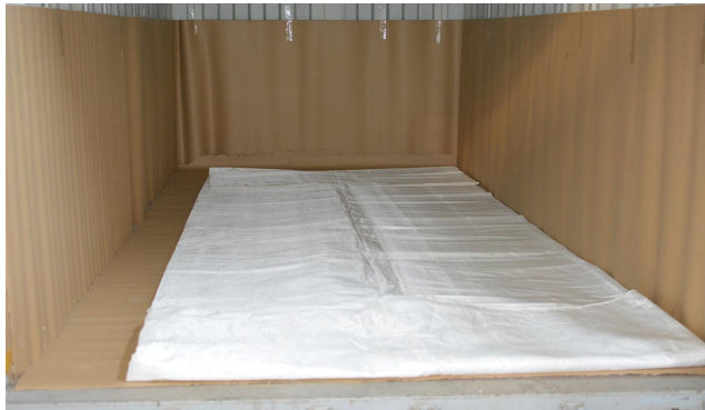
PUT CORRUGATED PAER AND FLEXITANK