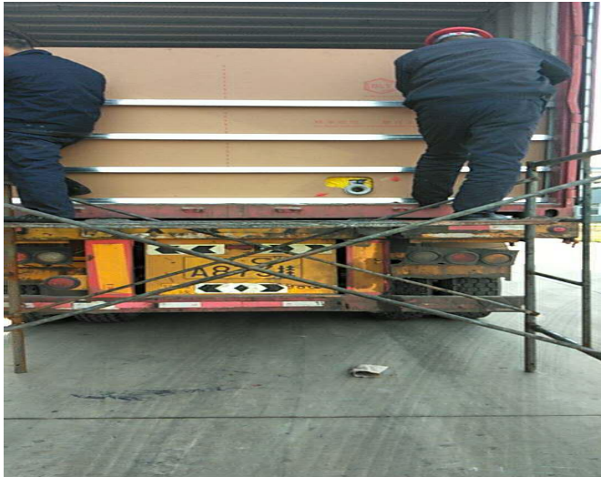
PLACE STEEL BAR