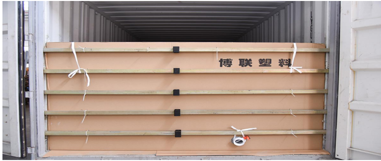
READY FOR TRANSFER LIQUID