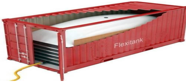
26MTS LIQUID BLACK FLEXITANK